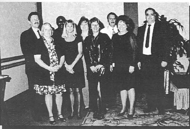
The new District Directors for 1999