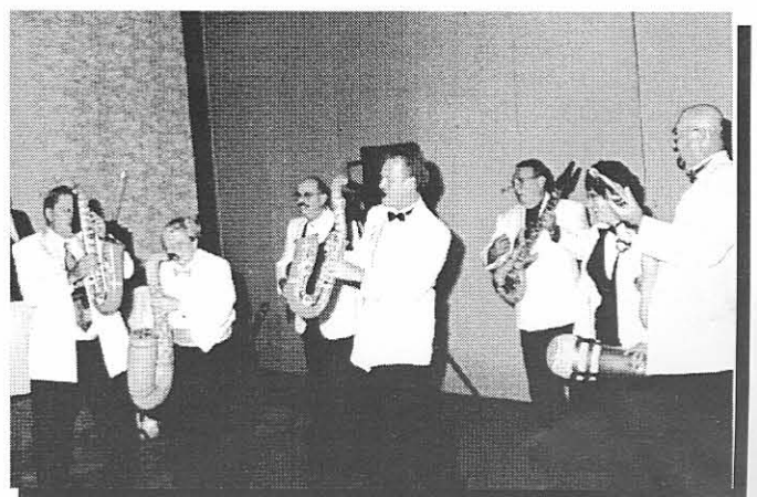
Past Presidents performing at the Installation Banquet