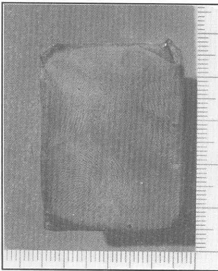
Print as it appears on initial exam when removed from freezer.

Editor's note: Gary states that he has used this procedure in actual cases and laboratory controlled experiments!