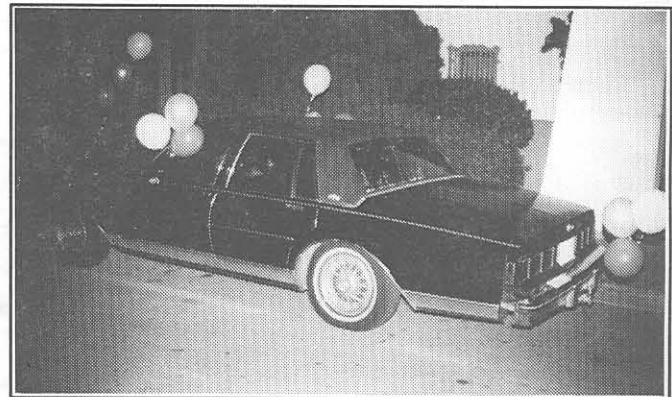
Does anyone know who's vehicle this is? Is there a product identification number on it somewhere?

Human Resources Coral Springs Police Department 2801 Coral Springs Drive Coral Springs, Florida 33065 Phone: 305-346-1310